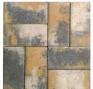
SANDSTONE / YELLOW TAN / MEDIUM CHARCOAL