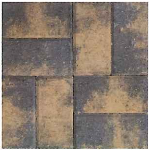
TAN / CHARCOAL