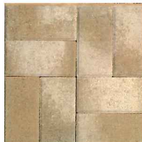
SANDSTONE / YELLOW TAN