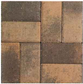
TAN / GOLDENROD / BROWN