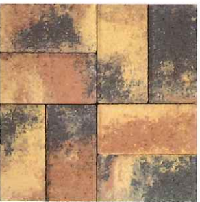
OLD CHICAGO I