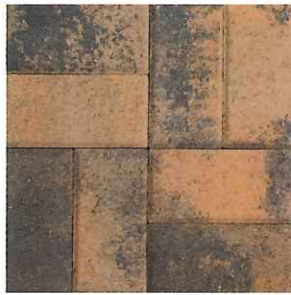
TAN / GOLDENROD / CHARCOAL