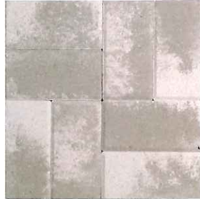
WHITE / CAMEL