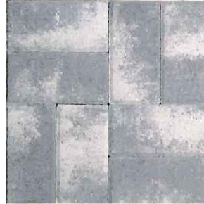
WHITE / HUNTINGTON