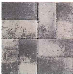
NATURAL / CHARCOAL