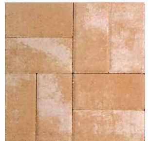
CORAL / GOLDENROD