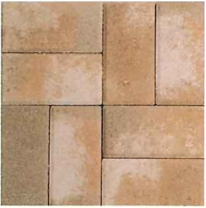
CORAL / TAN / GOLDENROD