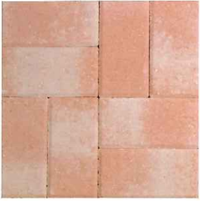
CORAL / PEACH