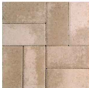
CORAL / TAN