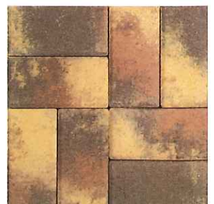
OLD CHICAGO II