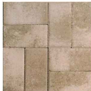
CORAL / DARK TAN