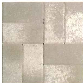
SANDSTONE / CAMEL